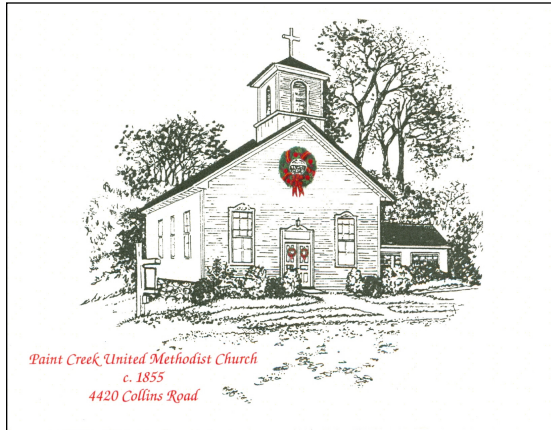
Paint Creek United Methodist Church c. 1855 4420 Collins Road